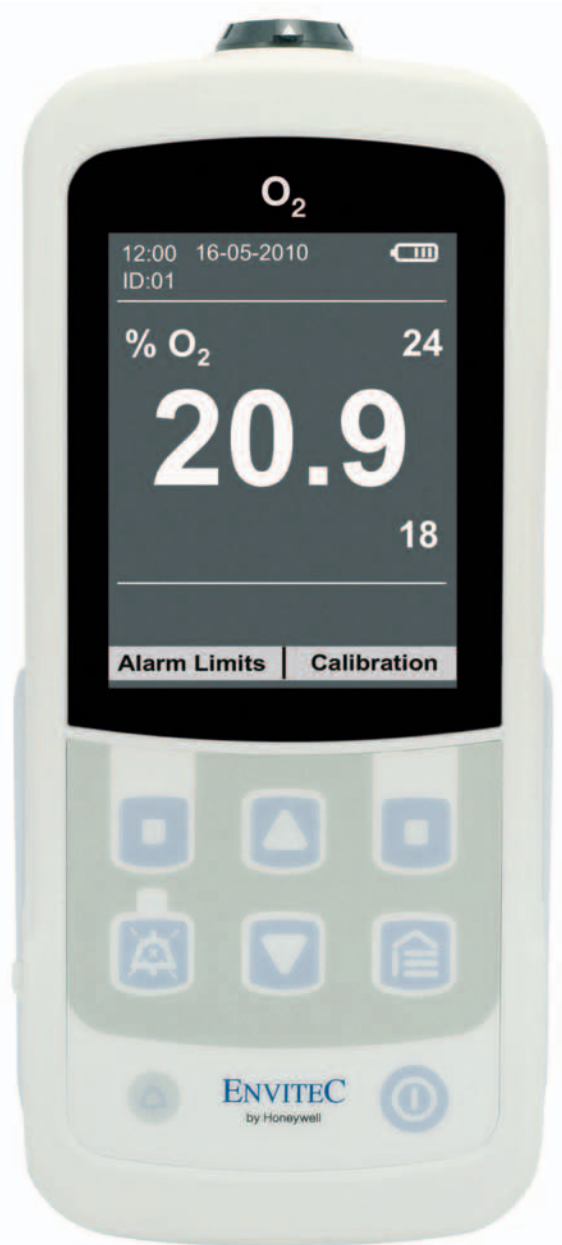
The MySign®O (actual size)